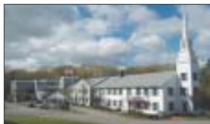
Meetinghouse Village – Independent Living

Our apartment-style housing in Vernon, Vermont and Kittery, Maine enables independent seniors to live and socialize in a community of peers.