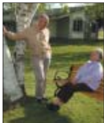
The Birches – Independent Living