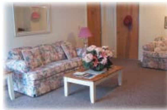
Replacing worn-out carpeting well past its prime, the new carpets installed in 2005 have added to the comfortable living experience at Meetinghouse Village. We couldn't have done it without your support.

Some of the greatest challenges of 2005 were faced at Meetinghouse Village. Our longstanding efforts to develop the second phase of the South Campus were defeated due to local