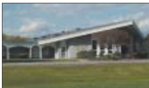
The Green – Nursing Care