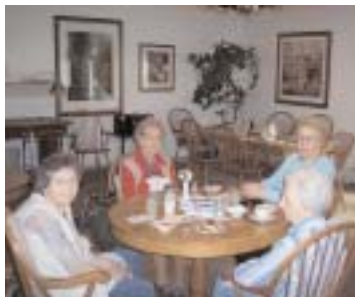
Every day, residents appreciate the finishing touches in Vernon Hall that were enabled by your gifts last year.

So in addition to saying “Thank You,” we want to say “Blessings” to all our donor family. May the giving and receiving continue to be gratifying on both ends!