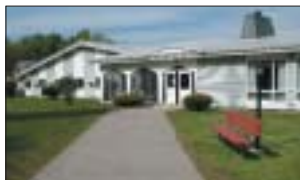
The Hall – Assisted Living

ACRC also provides physical therapy and Alzheimer's care – both utilizing leading-edge methods and highly qualified professionals to restore elders to the best of their abilities.